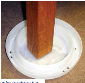
Interceptor device under furniture leg.